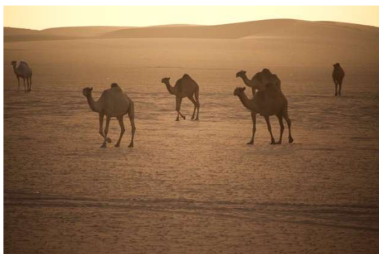
Two Special photos we received last year

We will be sending support to our troops as long as they are deployed in Service to America. And we hope you will remember, for some of these troops, our personalized stockings will be the only gift they will receive for Christmas.